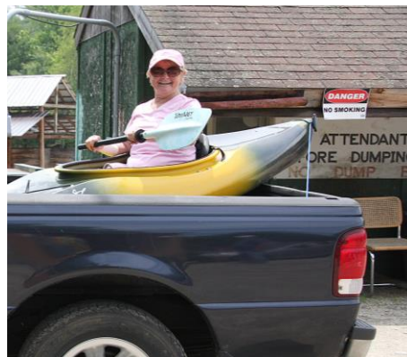
No such thing as too much kayak time.