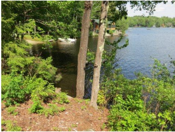
Who Wouldn't Love This Paradise?