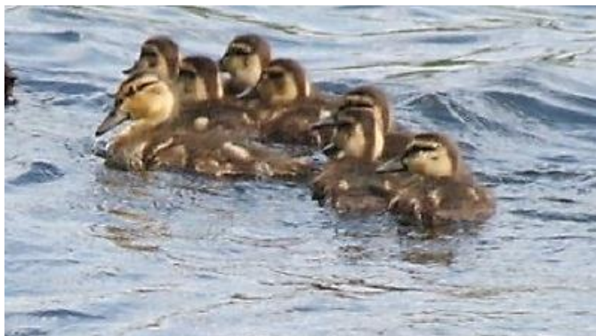
Family Outing at Crescent Lake

How about childhood friend Paul Obuchowski noticing "The String" out on a Crescent Lake dock one sunny day about four score and seven years ago?