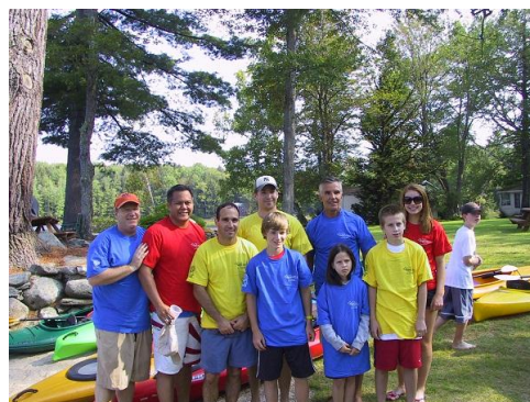
2011 Kayak Race Winners