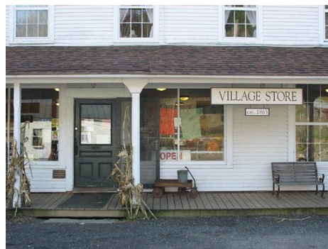
The Store Today 1068 Rte 123A, South Acworth 603-835-6547

June 30 – Spring Music Fest featuring local bands