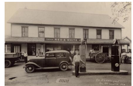
The Village Store in Days of Yore

Come hungry! Coffee, breakfast sandwiches, lunch items, and delicious pastry are offered every day. Take away plus take and bake meals are offered for dinner options. Seasonal fresh produce, grown in the community garden behind the Store, is offered in the coolers. Wine, beer, soda and FREE WiFi are always available. (continued on page 6)