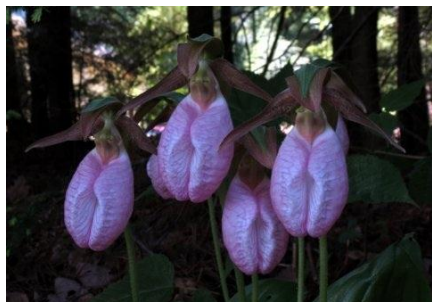
Beauty Wherever You Look: Ladyslippers by Laurie Wallace